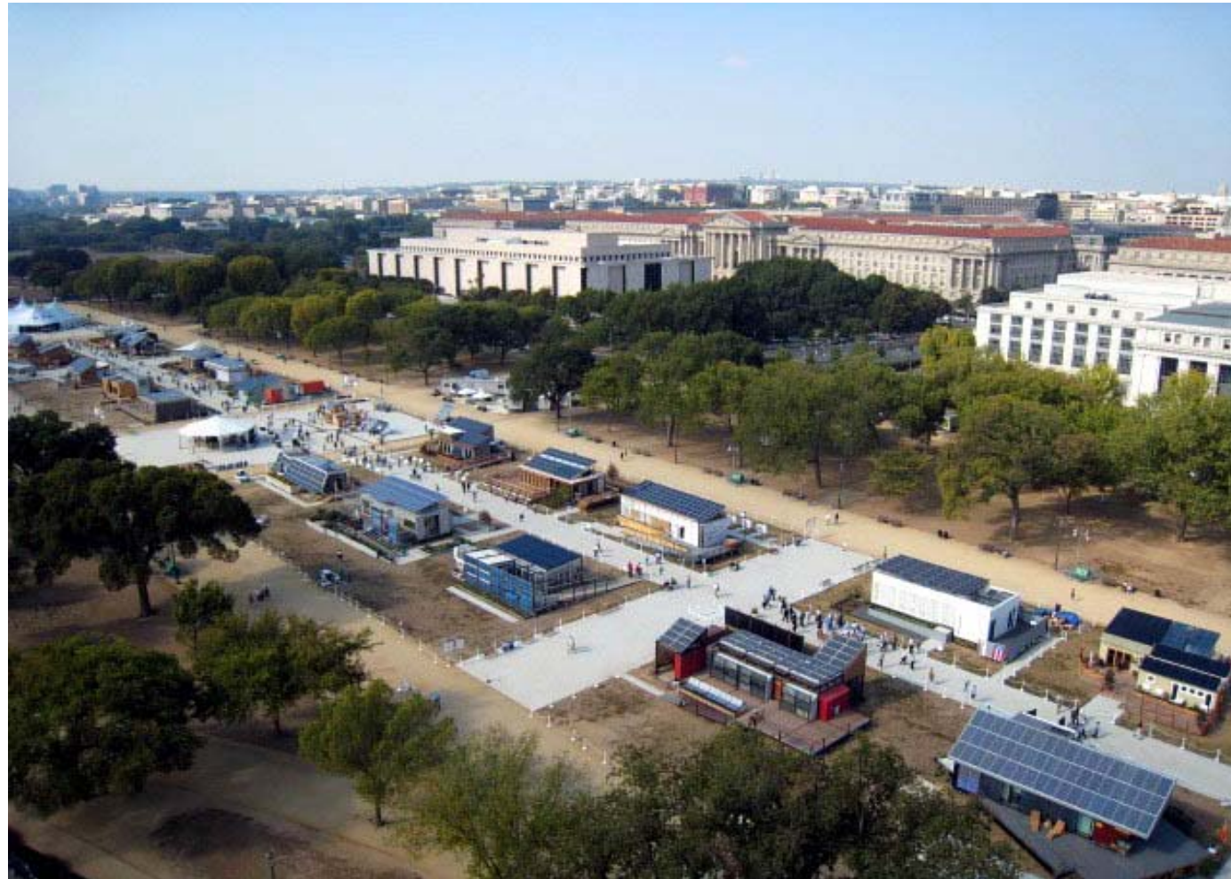
Aerial View of the 20 Solar Decathlon Entries in 2007 including Team Montreal

Leave: Friday October 9, 2009 Return: Tuesday October 13, 2009