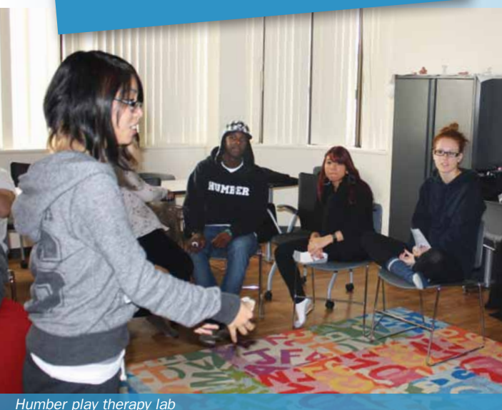
Humber play therapy lab

Starting in 2013, graduates of the Child and Youth Worker, Advanced Diploma program will be eligible to apply for advanced standing into the third-year of the degree.