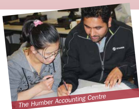
The Humber Accounting Centre

Humber knows that students may change their minds after declaring their major. If a student's interest changes during their first two years of study,