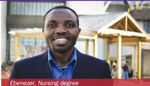
Ebenezer, Nursing degree